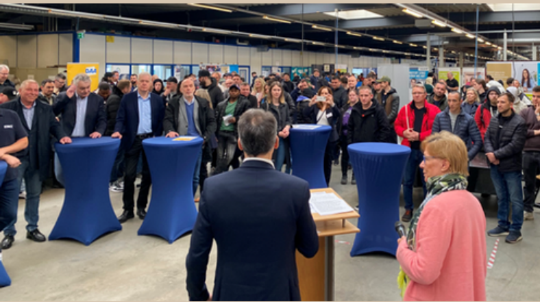
Opening Speakers, guest, and visitors at the Multiplier Event in Germany.