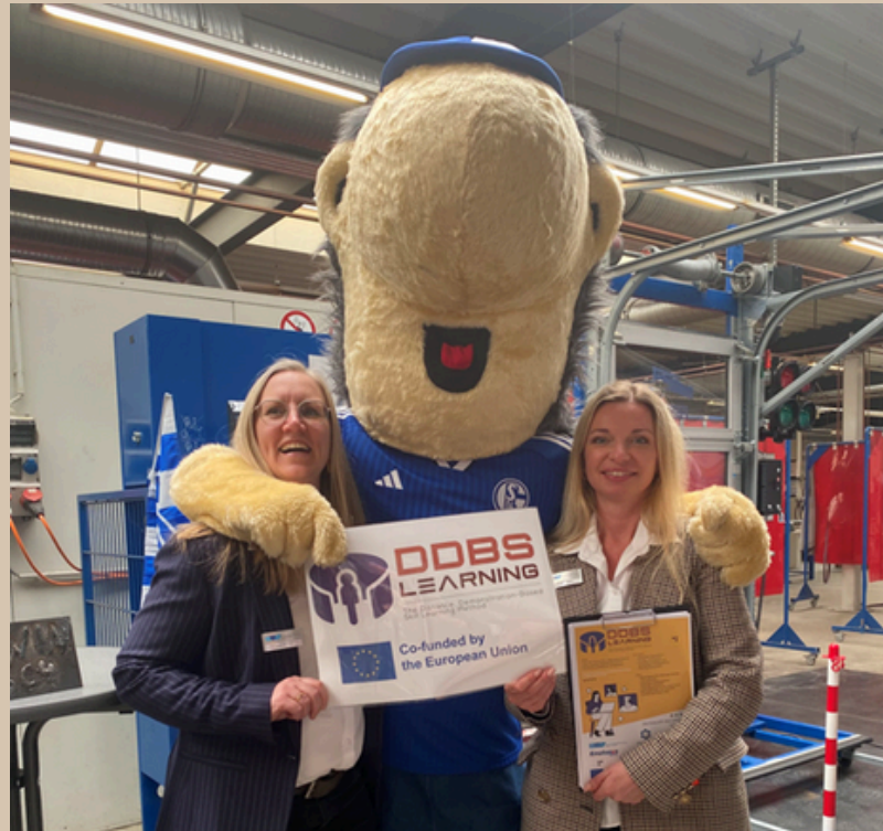
DDBSL Project manager (l.), local football team Schalke 04 mascot (m.), DDBSL team member (r.) from the German partners DVS.

On April 24, 2024, the SLV Bildungszentren Rhein-Ruhr in Gelsenkirchen welcomed over 500 visitors to an inspiring open day titled "Rethinking Education!", as a part of the Erasmus+ project presentation. The event featured insightful seminars and demonstrations focusing on remote learning and innovative welding techniques including the DDBSL method and virtual welding simulations. These presentations sparked broad interest and fostered exchange on cutting-edge educational approaches in welding technology training. We are immensely grateful to all the speakers, attendees, and behind-the-scenes organizers whose dedication made this event successful. We look forward to nurturing the connections made and exploring how these new opportunities evolve. Stay tuned for our future events, and once again, a heartfelt thank you to everyone involved!