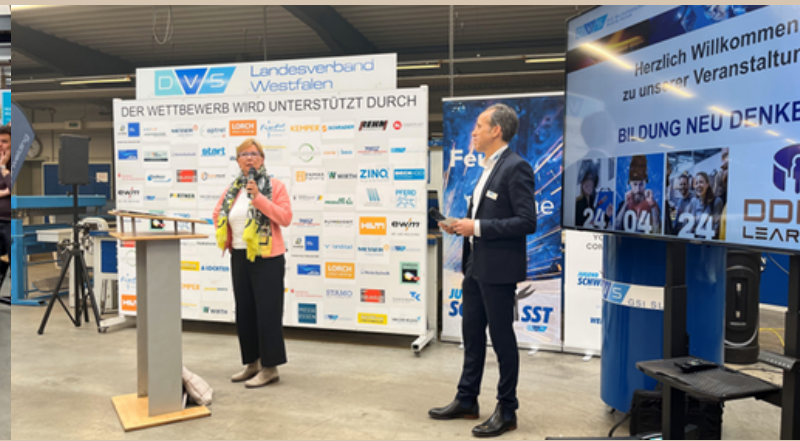
Mayor of the city Gelsenkirchen and the Head of SLV Bildungszentren Rhein-Ruhr speaking during the Multiplier Event in Germany.

In Cyprus, Emphasys organised 4 different events, with a participation of over 60 participants. The profile of participants has included VET schools including VET providers, VET trainers and VET students, HEIs including HE teachers and HE students, adult educators and other organisations related to the field of adult education. In Greece, TIHC has gathered 65 participants, and in Spain, INFODEF has reunited over 70 representatives from the adult education sector, as well as VET and policymakers from the local and regional governments.